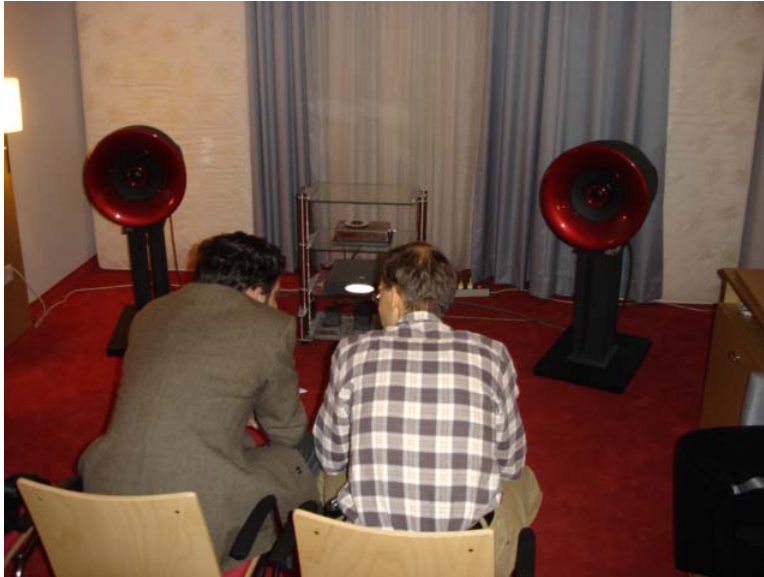
47 lab shigaraki /Avantgarde / Solo