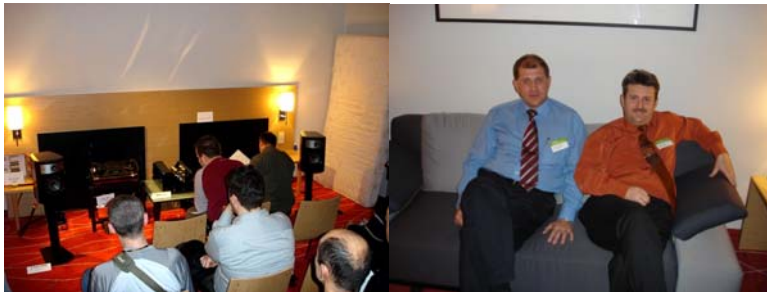
This room featured Jadis CD Player with the Italian Viva 845 Valve integrated along with the new Focal JM Lab Electra, and proud representatives of the distributor L`auditeur.