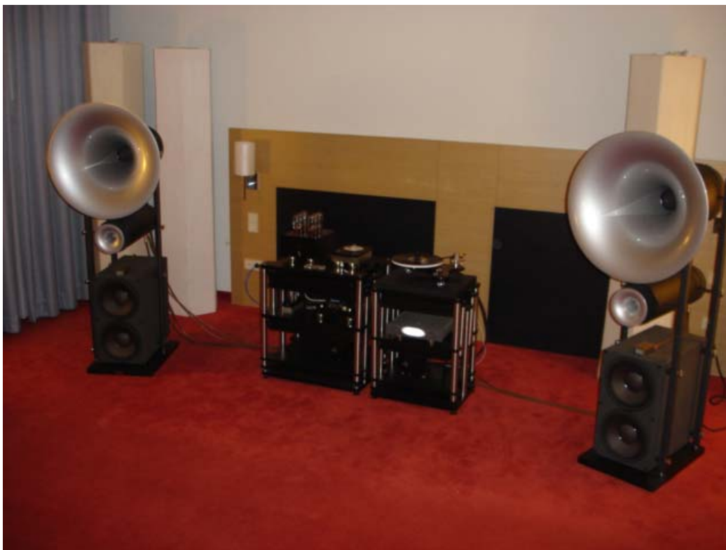
47 lab “flatfish” and “Progression” /Funk Firm Turntable with Schroeder Tone arm ZYX cartridge/ Final laboratory / Avantgarde Amplifier/ Avantgarde Duo. This system was featured on the evening news ! oh yes in Hungary this stuff makes the TV and the radio and the newspapers too!